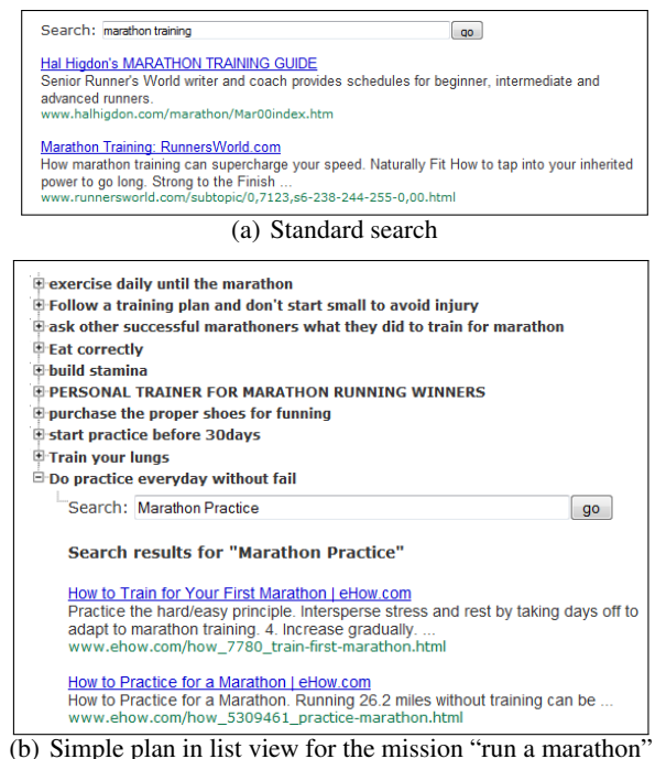
b) Simple plan in fist view for the mission run a marathor

One of the benefits of the simple plans generated by Crowd-Plan is that they provide an explanation (in the form of goals) for the search results returned to the user. To study the effect of explanations, for each mission, we asked 10 Turk-